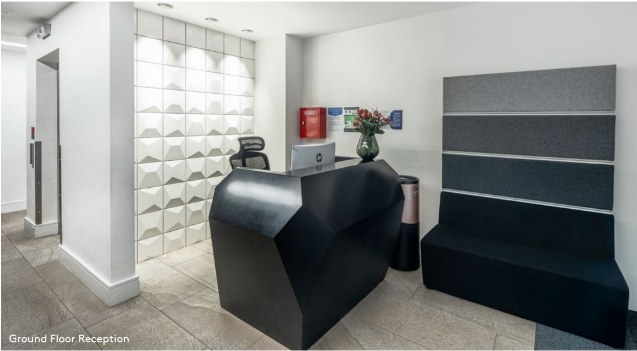
Ground Floor Reception